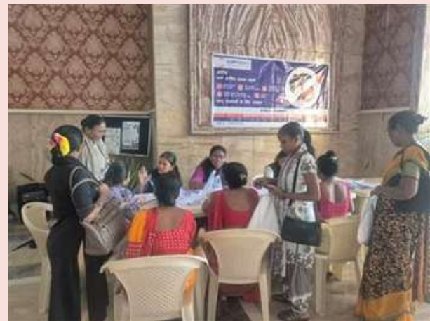
Camp in action, Day 1 and Day 2

A two day camp was held on December 12 and 13, 2025.