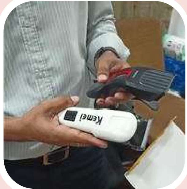
Donation of Grooming Equipment for Sr. Citizens Date: 06th December, 2025 Beneficiaries : 15 Cost: Rs. 2600