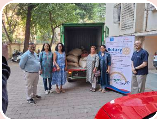
Sarathi (Kandivli) and Sawali (Dombivali) Date: 22 nd November, 2025 Beneficiaries: 80 Cost: Rs. 53500