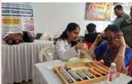
Seawoods Date: 21st December, 2025 Beneficiaries: 214