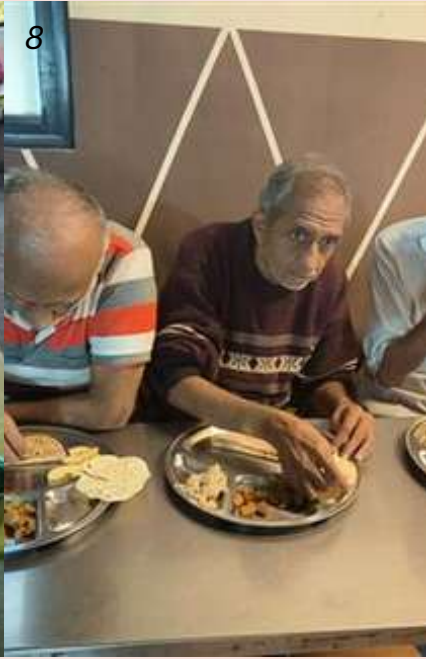
7. Rathod Vruddhashram Date: 11 th December, 2025 Beneficiaries: 46 Cost: Rs. 3000