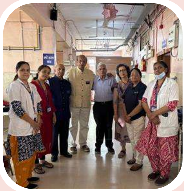
Donation of groceries at BMC Hospital Date: 19th December, 2025 Beneficiaries : 85 Cost: Rs. 67000