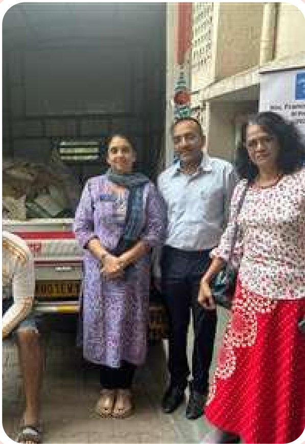
Grocery at Rupvan old Age home Date: 02 nd December, 2025 Beneficiaries : 45 Cost: Rs. 45000