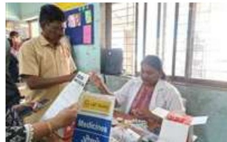
Dnyandeeep Seva Mandal High School Date: 20th December, 2025 Beneficiaries: 226